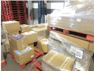
Lack of material organisation