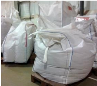
High levels of waste